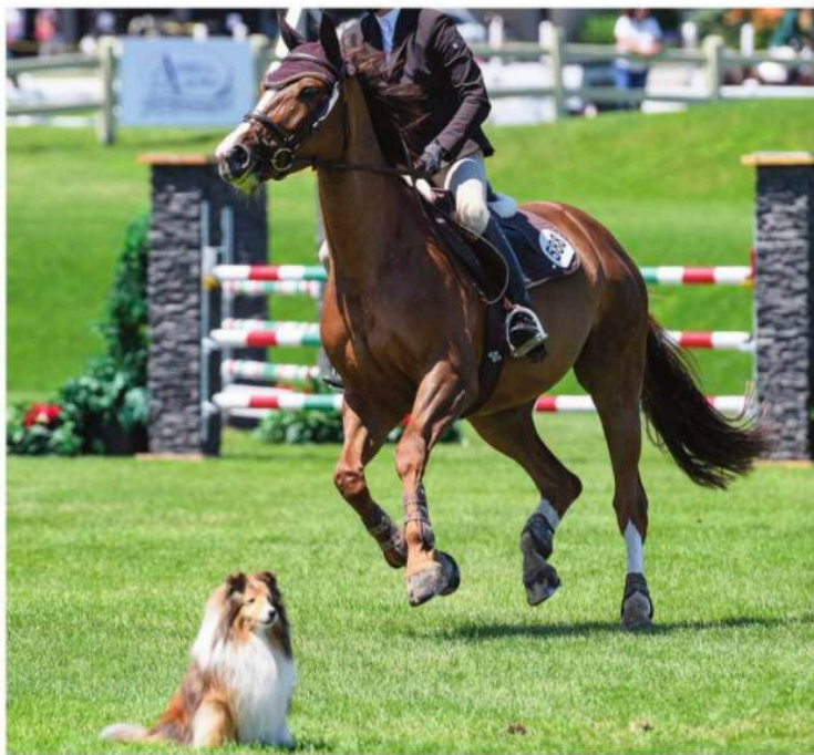
A loose dog can interrupt a horse and rider during competition.

There have also been situations where a dog enters a competition arena causing disruption of the horse's performance. If there's an injury to horse or rider that results from the loose dog in the ring, then the dog owner and the show management and/or venue could be held liable. On the other hand, if the horse and rider aren't injured but the horse's performance is disrupted, it's not